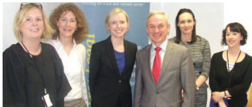
Northside staff with local TD and Minister for Jobs, Enterprise & Innovation, Richard Bruton, March 2014