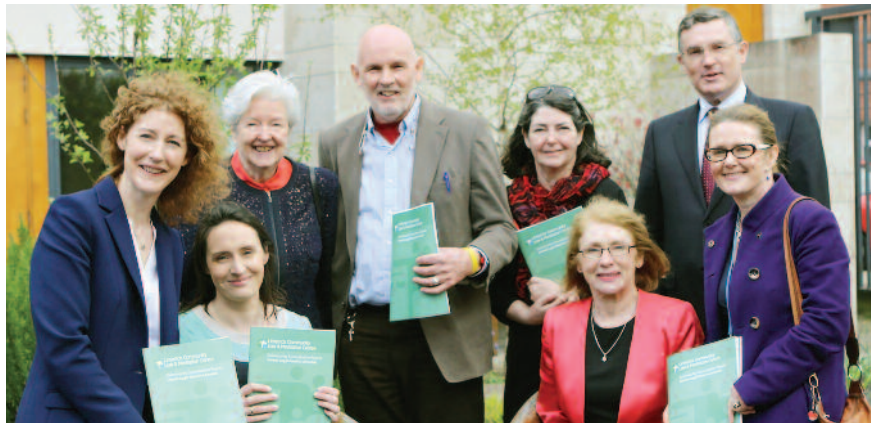
CLM staff at the launch of Limerick Community Law and Mediation Centre in 2013.

its membership scheme, the benefits of which include legal advice on issues affecting the member organisation's service users.