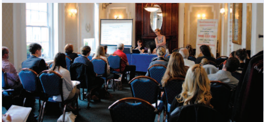
Attendees at the final consultation meeting in Dublin on 15 September