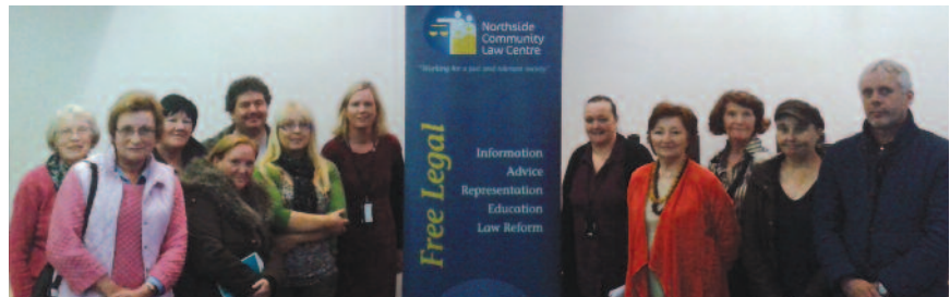
Attendees at a CLM 'Know Your Rights' community event in 2013

1. Community Law Centres: CLM Northside & CLM Limerick: CLM operates two Community Law Centres, CLM Northside and from 2013, CLM Limerick. A Community Law Centre is a non-profit organisation which works to reduce and remove barriers to the law, on the basis that all people should be able to access basic legal information and advice regardless